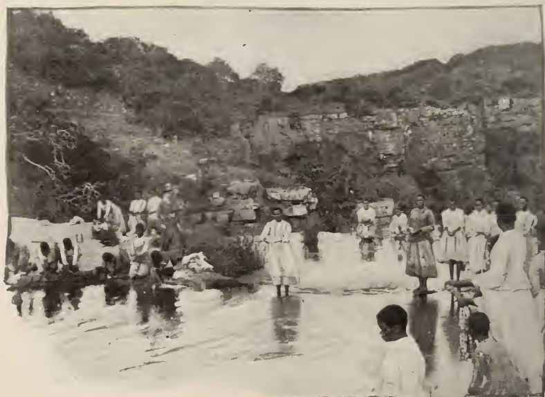
THE MISSION-SCHOOL LAUNDRY, INANDA.